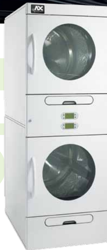
ES-3535 OPL Stack Dryer